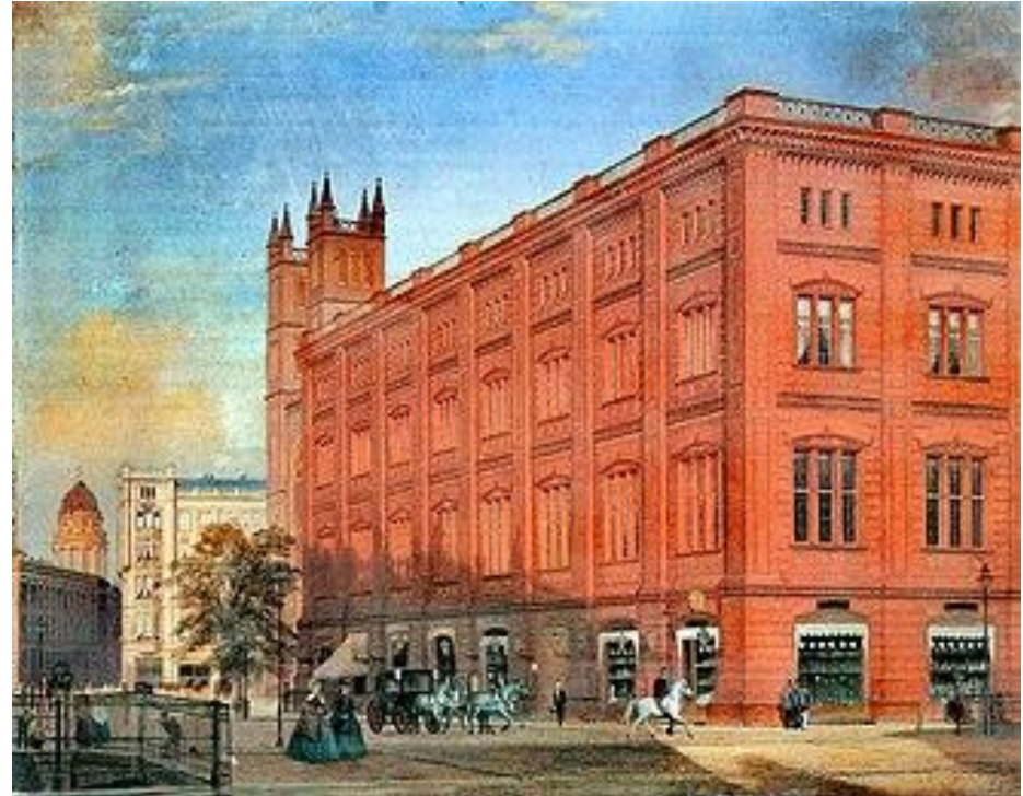
Royal Academy of Technology Berlin, Charlottenburg