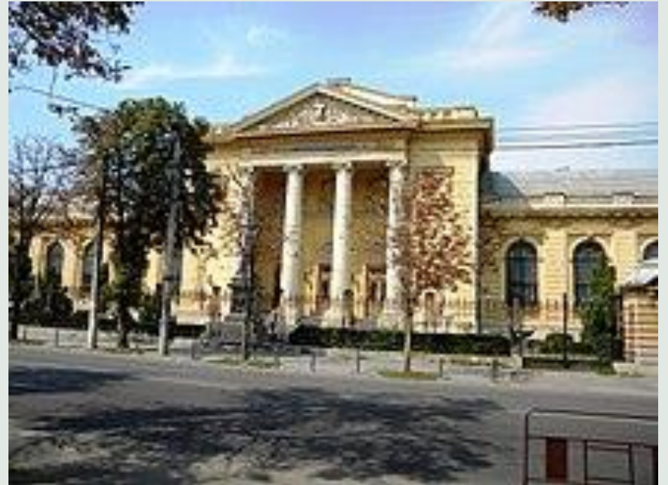
Carol Davila(University of Medicine and Pharamachy)

In her first internship year, she studied ophthalmology. Next year, she spent in Suceava at a poorly-equipped clinic during a typhus epidemic.